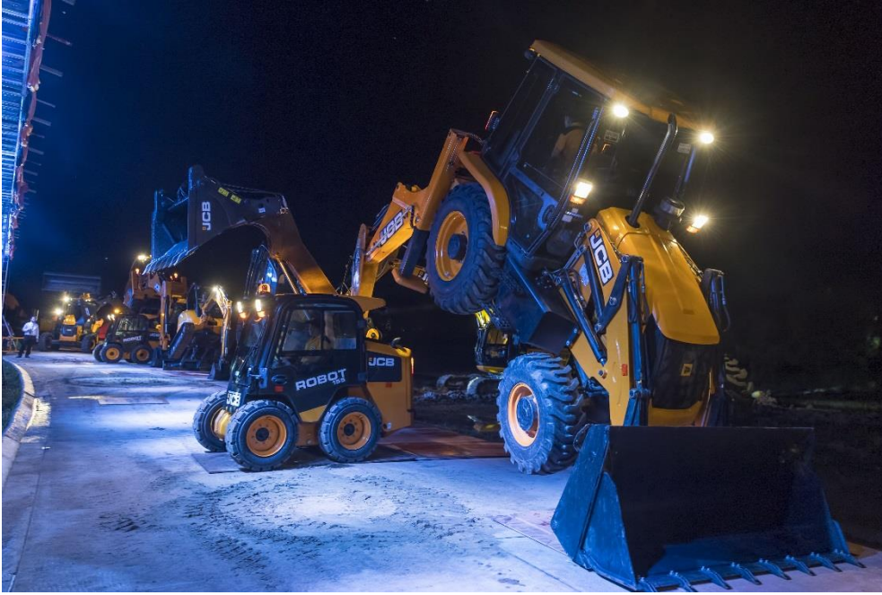
Dancing Diggers Show