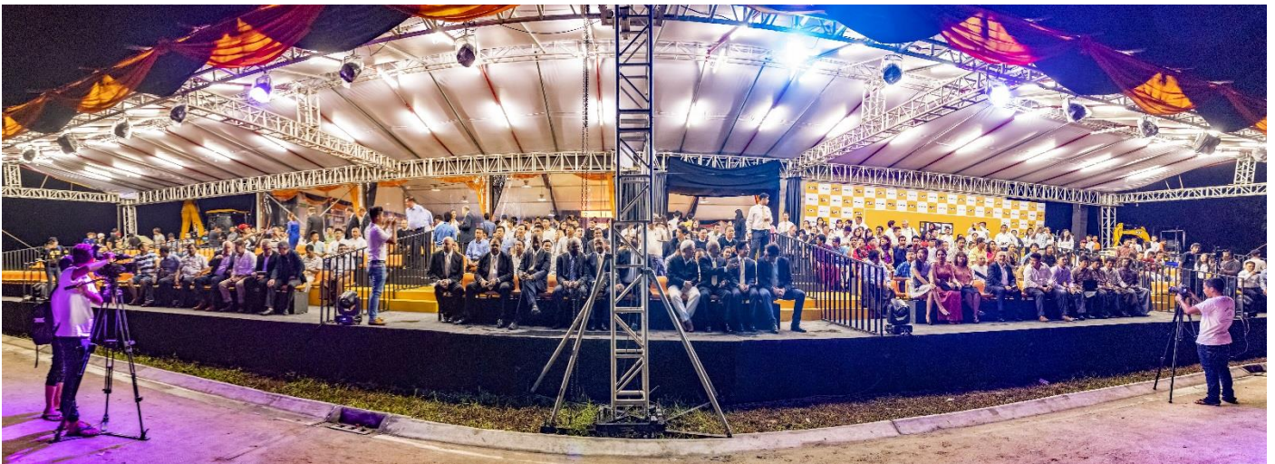
Guests watching the Dancing Diggers Show