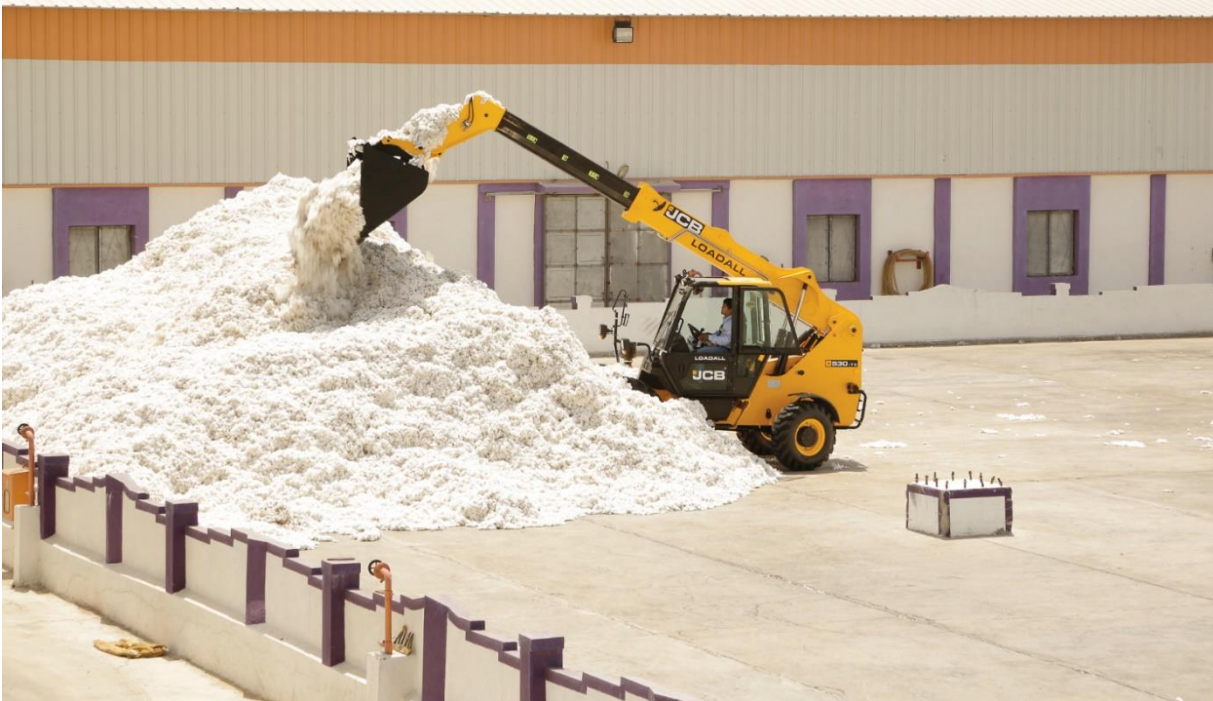
JCB Loadall (Telescopic Handler)