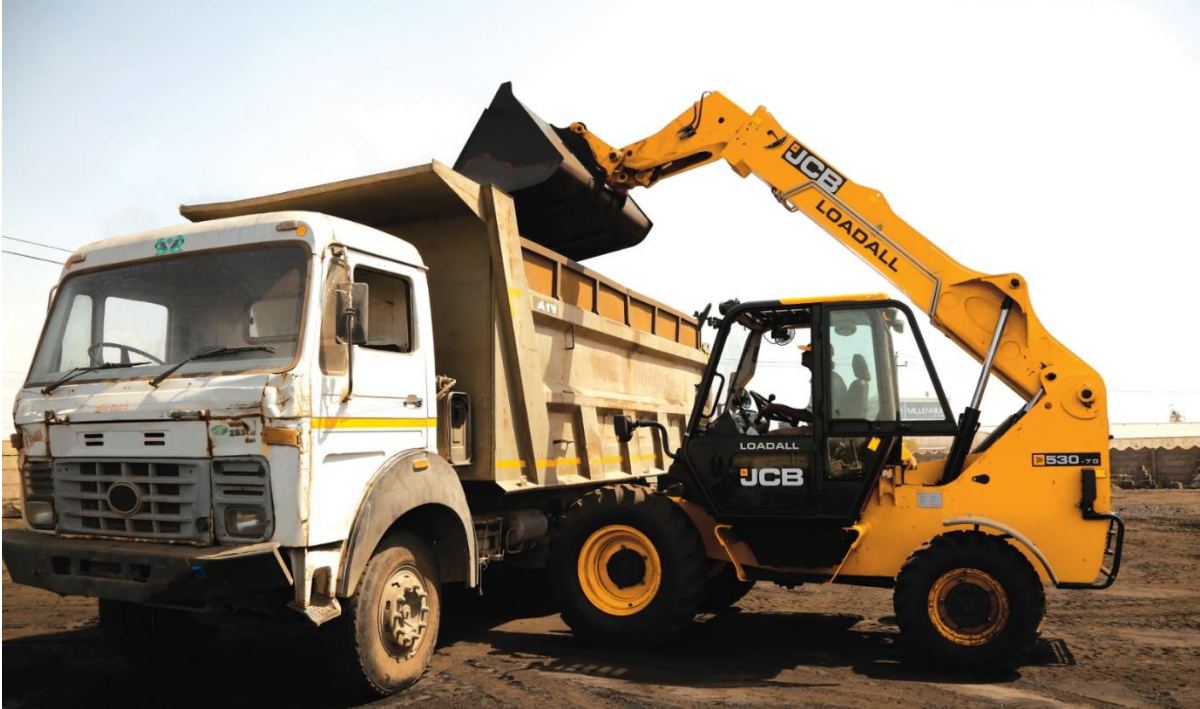
JCB Loadall (Telescopic Handler)