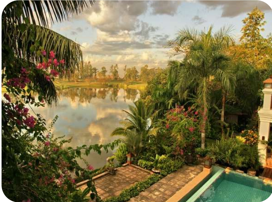
Pun Hlaing Golf Estate (PHGE)