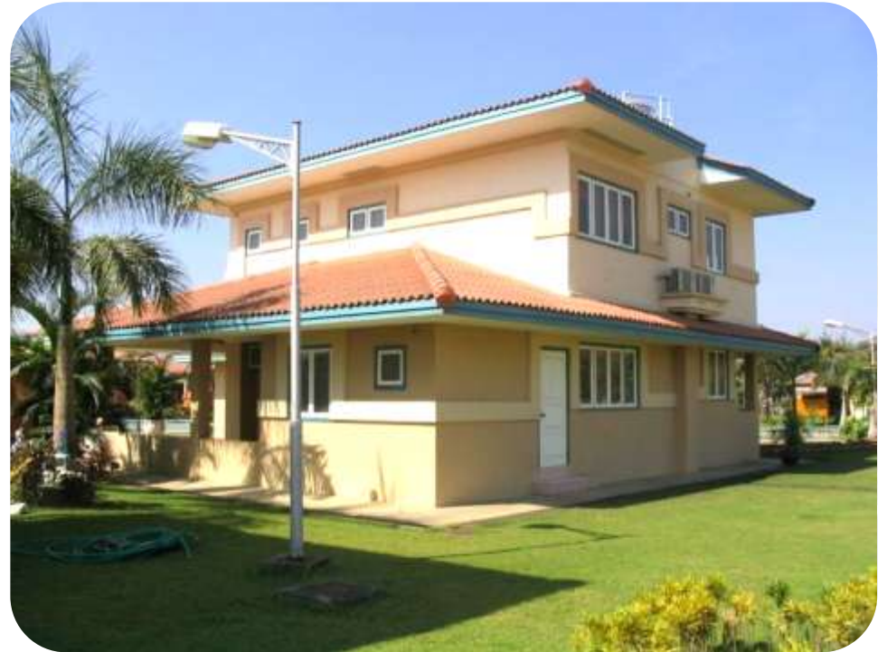
FMI City – Orchid Garden