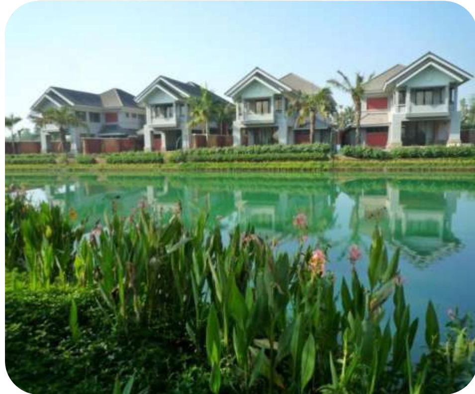
Ivory Court Residences